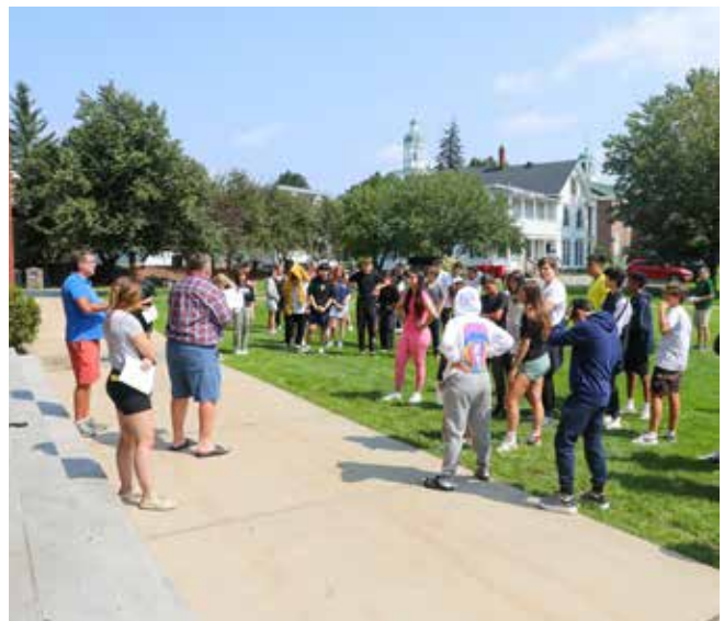
Photos from boarding student orientation 2024.