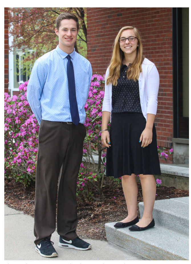
Shown above is an example of proper dress code.

SJA Gear Day is a chance for all students to show their SJA spirit! When Gear Days are announced, students are allowed to wear SJA gear on top, and dress code pants or skirts.