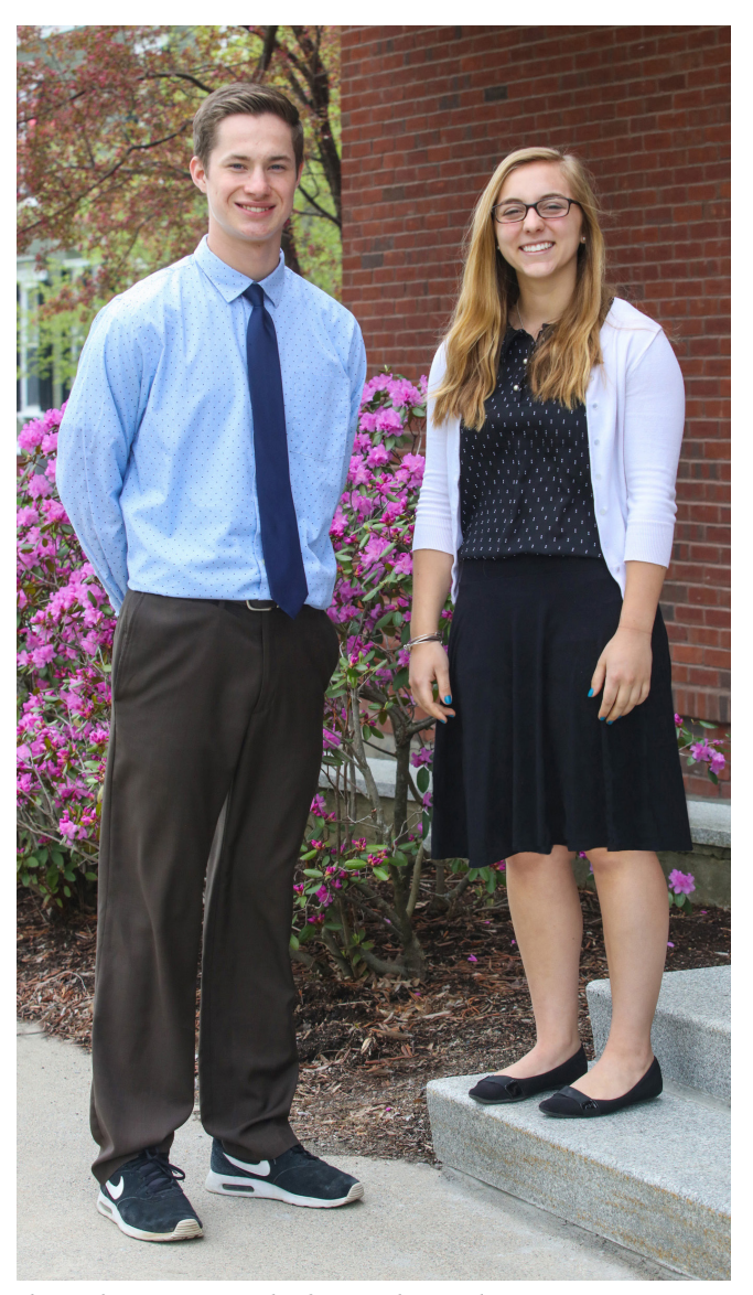
Shown above is an example of proper dress code.

Hair: Should be a natural color and trimmed so as to be above the collar, ears, and eyes.